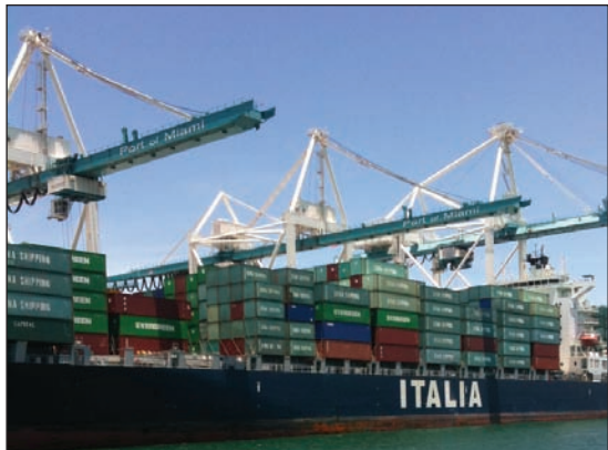
Port of Miami.