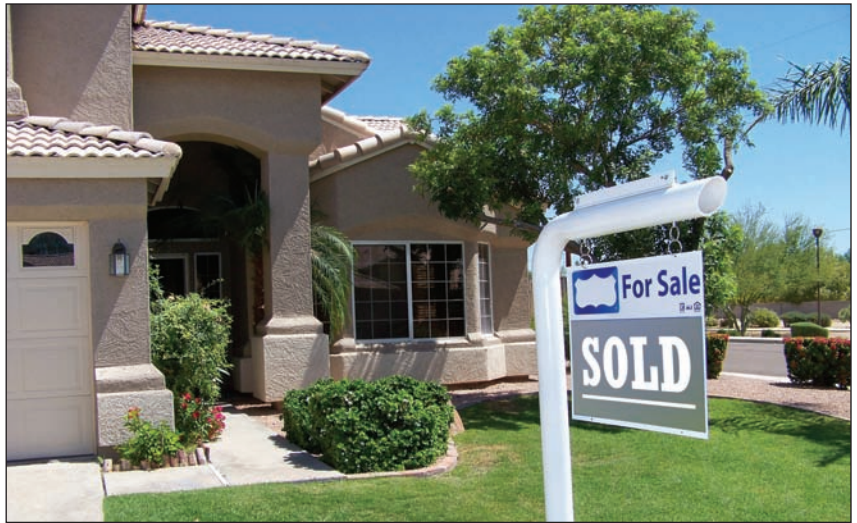
Pre-existing damage to a home had not been disclosed at closing.