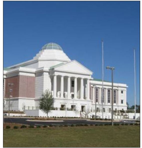
The First DCA's new courthouse in Tallahassee.

The ruling was not appealed and the files are now closed.