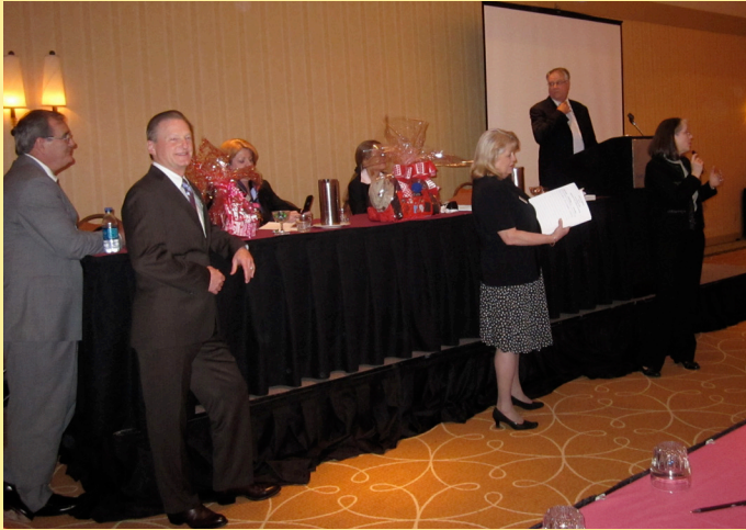
WLSC education seminar in Tampa, earlier this year.

W L WALTON LANTAFF S C SCHROEDER & CARSON LLP